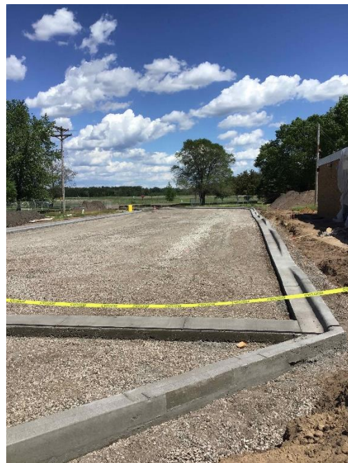
ECFC – new curb complete, bus loop is ready to for pavement