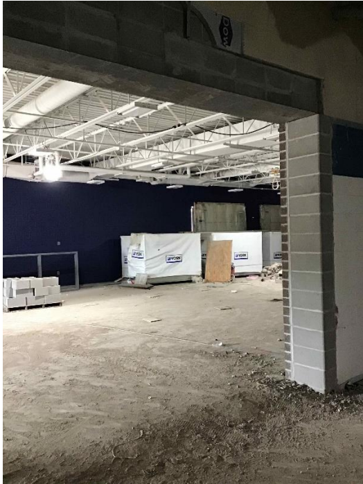
SFHS – new finished opening in area B fitness center