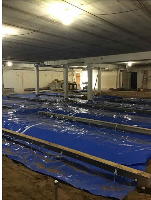
SFHS – vapor barrier installed in preparation for new concrete in boys' locker room area A