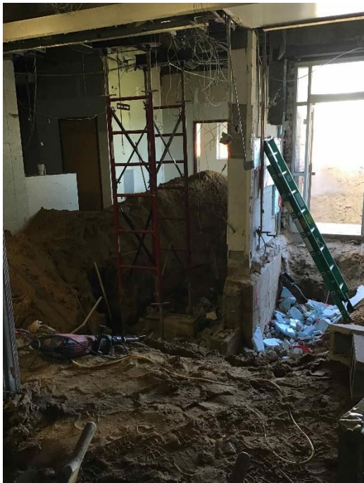
ECFC – digging out for vestibule alterations in area A