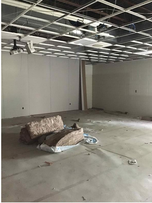
CCES – area a classroom drywall is complete