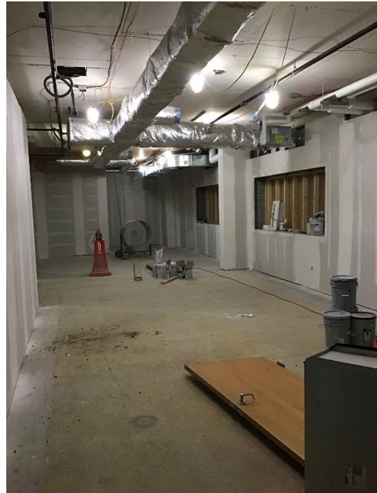
SFMS – new fitness room in area B West