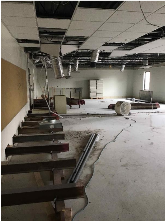
SFMS – temporary structural support in upper C & D