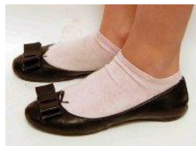
Inappropriate Footwear & Socks