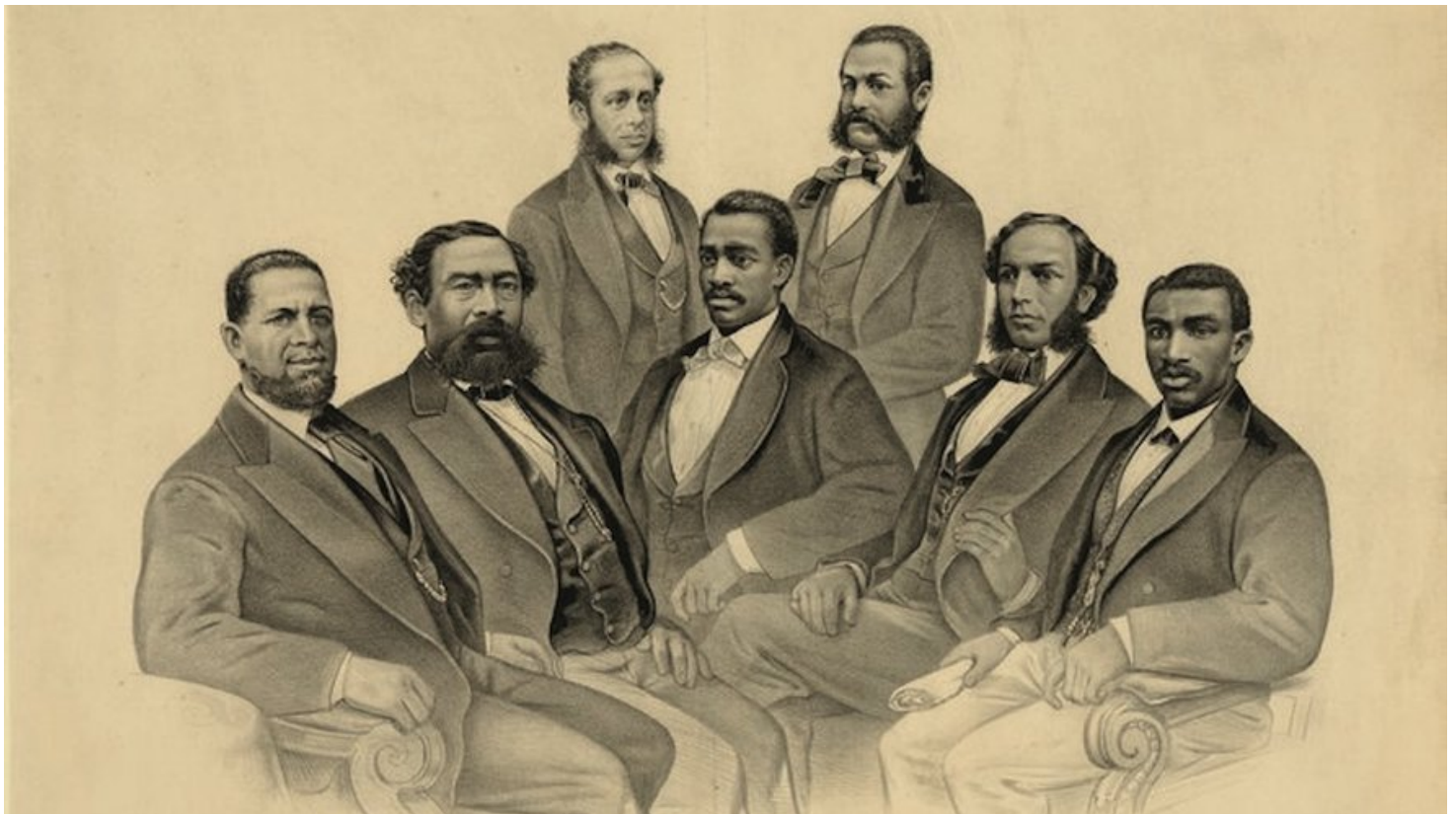
Image 1. An 1872 portrait of black Americans serving in Congress (from left): Hiram Revels, the first black man elected to the Senate; and representatives Benjamin S. Turner; Robert C. De Large; Josiah T. Walls; Jefferson H. Long; Joseph H. Rainey; and R. Brown Elliot.

I'll never forget a student's response when I asked during a middle school social studies class what they knew about black history: "Martin Luther King freed the slaves."