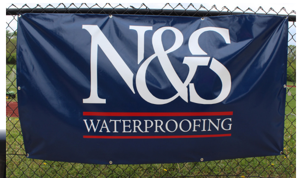
3' x 6' Banner