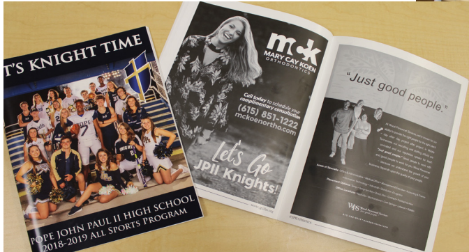
All Sports Program Ad