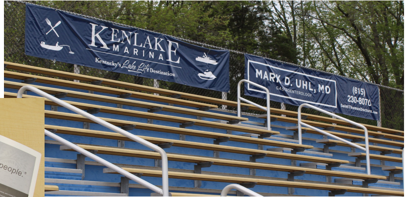
Football Bleacher Banner