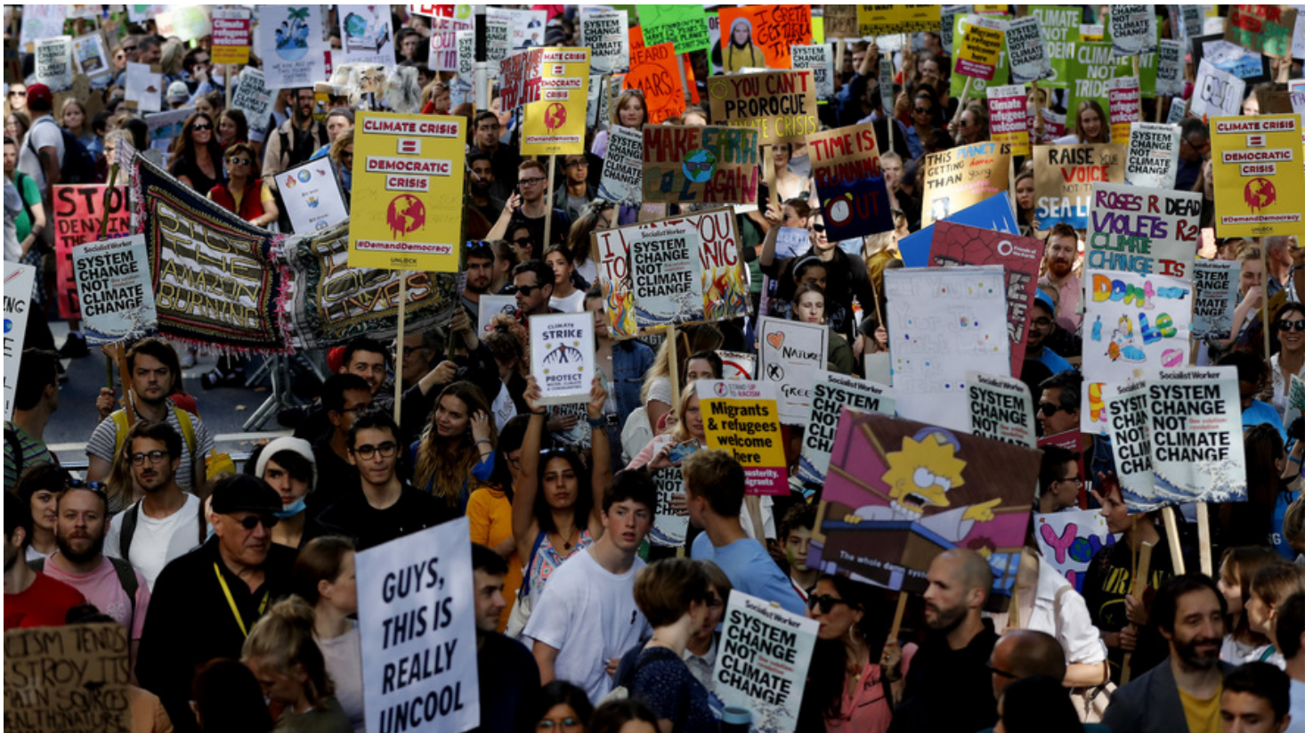
Image 1. Climate protesters demonstrate in London, England, September 20, 2019. Protesters around the world joined rallies calling for action against climate change ahead of a United Nations summit in New York City.

Young people from more than 150 countries skipped school on Friday, September 20. The youth were leading another series of worldwide protests. The effort across countries showed unity. They urged world leaders to act more quickly to fight climate change.