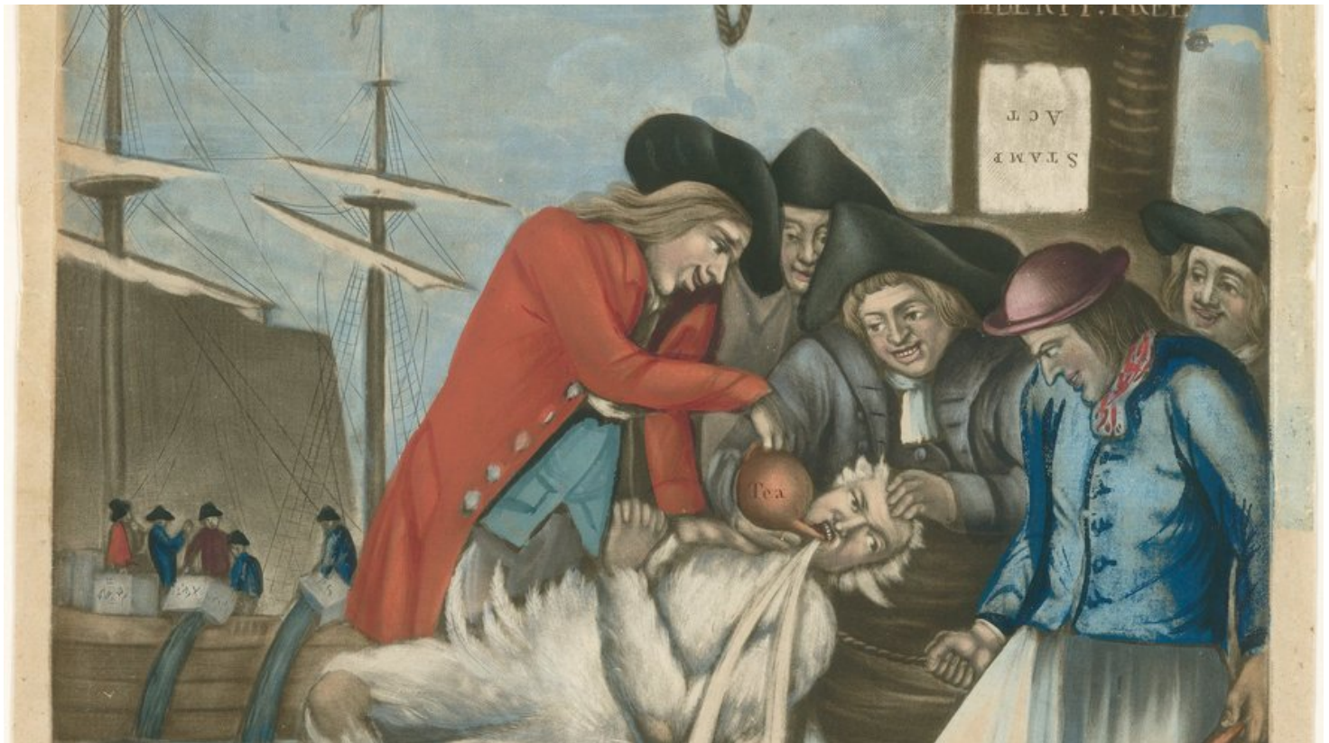
Image 1. This is an image of a man being tarred and feathered.

Editor's Note: Many major events surrounding the American Revolution occurred in Boston, Massachusetts. At the time, Boston was the capital of the Massachusetts Bay Colony, serving as the political and economic center for the colony.