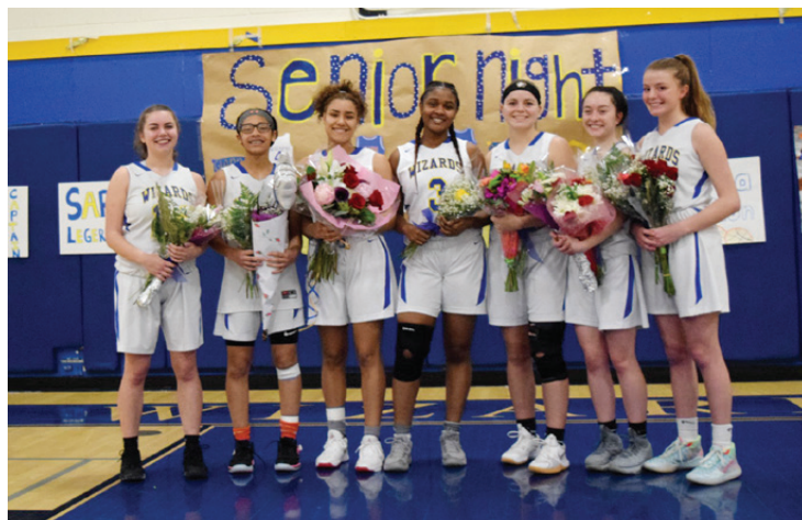
Grade 12 Washingtonville High School Girls Varsity Basketball players were honored during a home game.