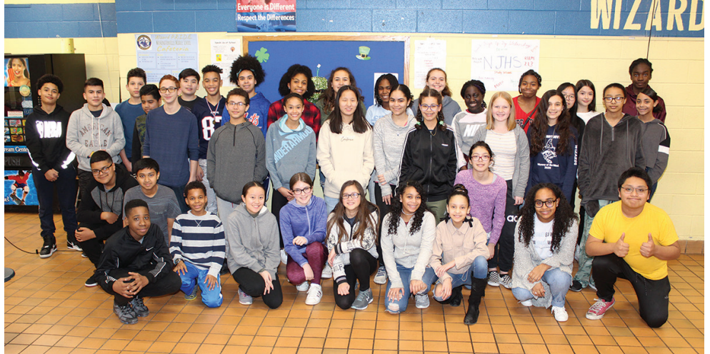
In addition to the official event, Washingtonville Middle School held an in-school ceremony to celebrate the students' continued hard work.