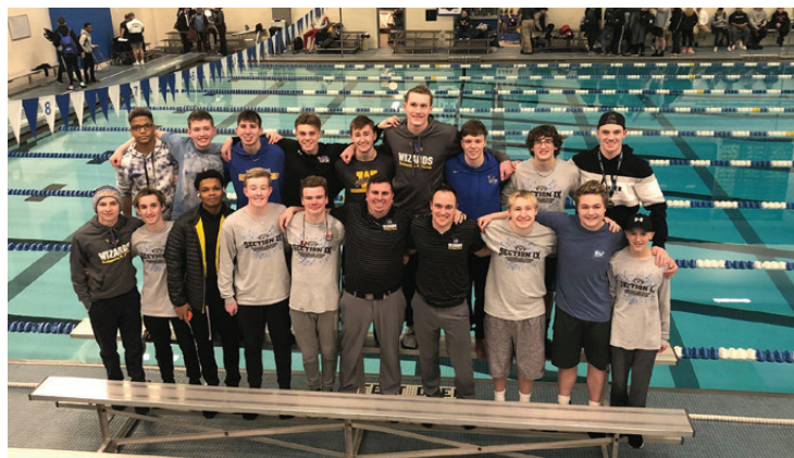
The Washingtonville High School Boys Swimming and Diving team swooped in and triumphed at the Section 9 finals, finishing their season with a league record.