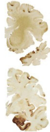
Stage III: Tau hot spots begin to blend with one another. Tangles appear more diffusely throughout the ridges of the brain. Tau begins to collect in the hippocampus (involved in learning and memory) and amygdala (involved in decision making and emotions).