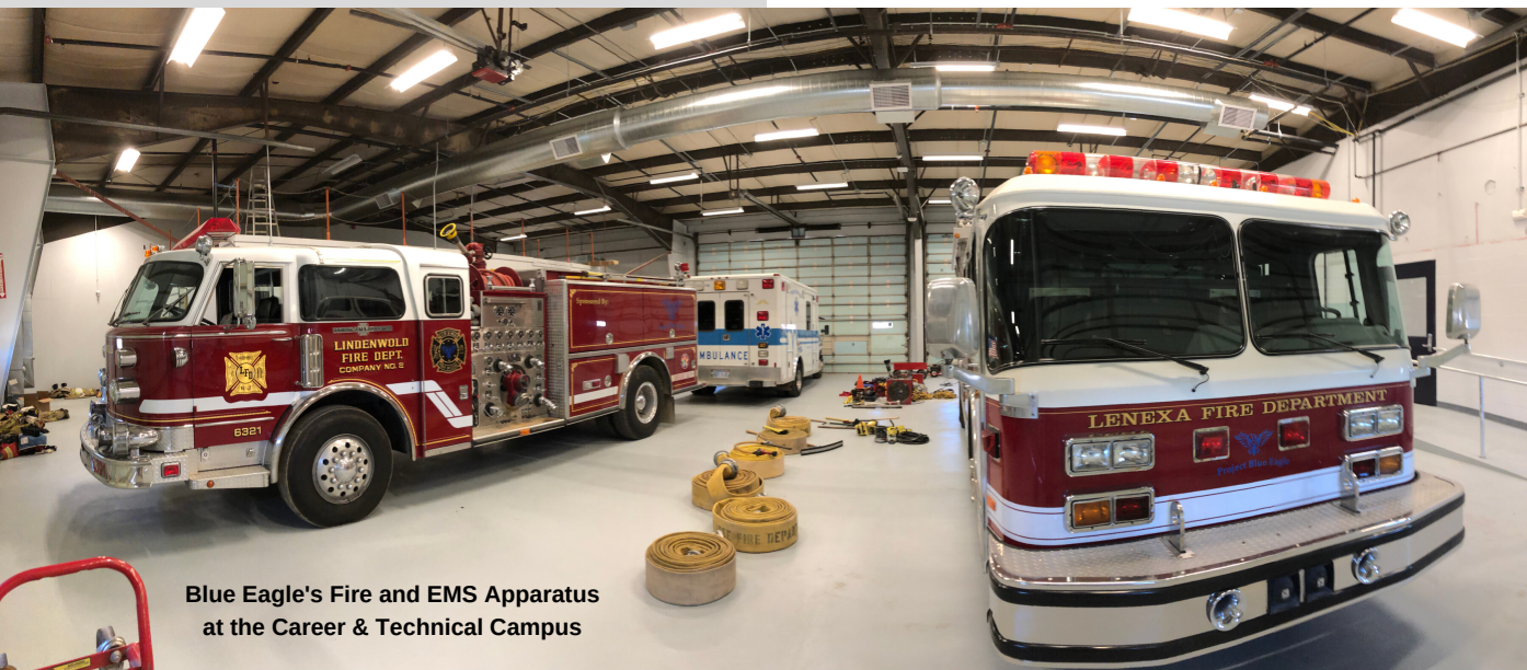
Blue Eagle's Fire and EMS Apparatus at the Career & Technical Campus