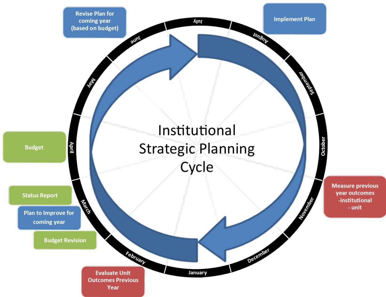
Figure 2- Institutional Strategic Planning Cycle

The annual strategic planning cycle begins in November with each unit, and the institution as a whole through the Office of Institutional Research, gathering data on the prior year's plan and outcomes. Program leaders then evaluate the previous year's plan based on the data they obtained. Next, the program leaders develop plans for the upcoming academic year and submit budget requests, called Status Reports, to the Vice President for Finance. The final budget for the upcoming fiscal year is established by the Executive Council and approved by the Board of Trustees. Based on the whether the budget requests were approved, programs then have an opportunity to make adjustments to the coming year's plan of action. Plans are implemented in August, to be evaluated the following year. The annual Institutional strategic planning cycle is shown in Figure 2- Institutional Strategic Planning Cycle.