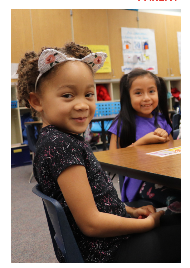
Program Site: Harvard Elementary

The dual language program relies on strong family involvement to link students, teachers and families in the learning process.