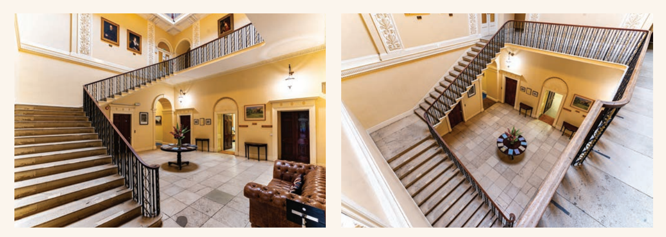
The grand central staircase is our usual location for the bar and is an absolute must for couples' photographs.

A sumptuous wedding breakfast may be served in Old Hall , which impresses with its classical friezes and marble fireplaces. Our hire charge is inclusive of all tables, chairs and linen.