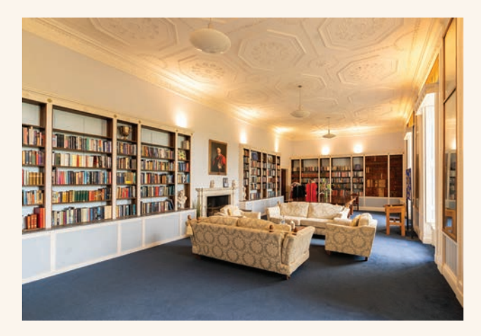
The bride and groom may then join their guests for a champagne reception in the Workman Library , with its full-length double aspect windows giving a spectacular view of the surrounding parkland. This room also provides an alternative space for guests who would like somewhere quiet to take in the day.