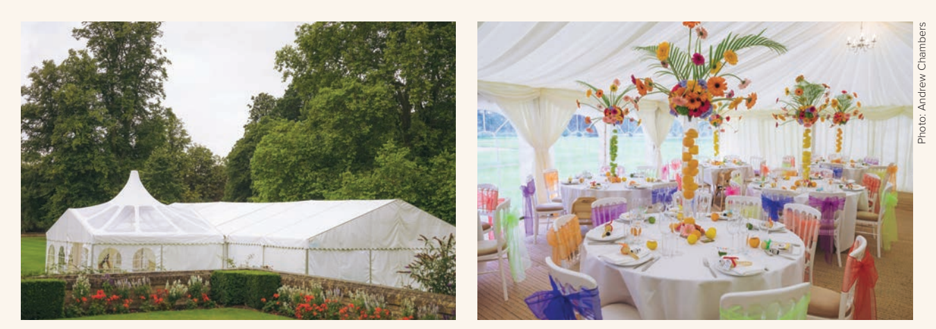
Our marquee weddings take place on the formal South Front Gardens and are the perfect place to watch the evening sunset, whilst also being a fantastic space for outdoor garden games.