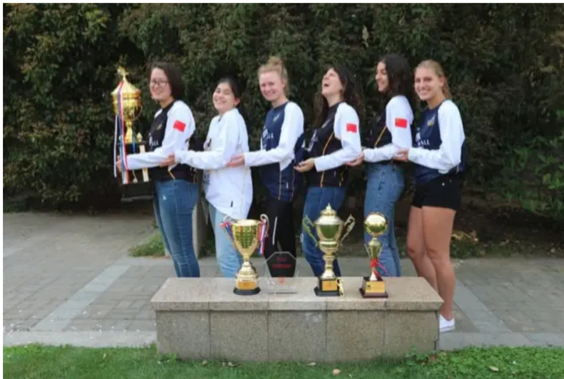
Senior Girls with all their sportmanship trophies they have won over their 4 years of ACAMIS