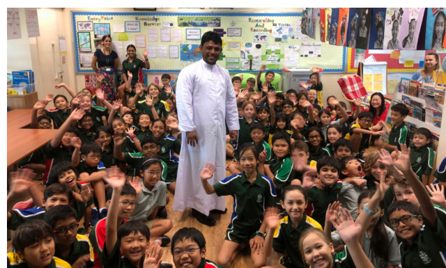
Service Learning: From Prep 1, students are encouraged to participate in whole school service events, which support our chosen Global Initiative Programme with our charity of choice, the Lasallian Community Education Services in Colombo, Sri Lanka.