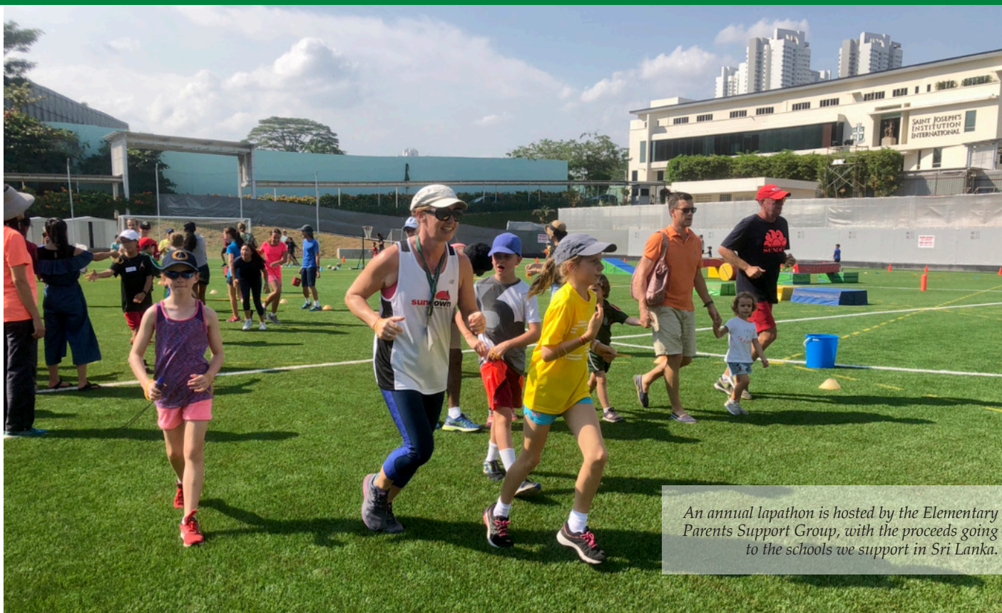
An annual lapathon is hosted by the Elementary Parents Support Group, with the proceeds going to the schools we support in Sri Lanka.