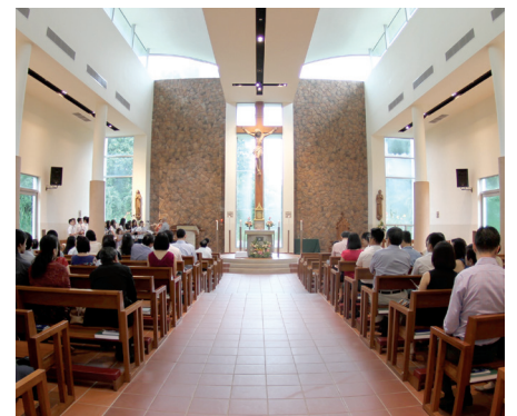
Sanctuary of Divine Love: a chapel on campus for the SJI International community.

The Lawrence da Silva Sports Complex boasts a variety of amenities ranging from Rock Climbing and Swimming to Ball Games courts, just to mention a few.