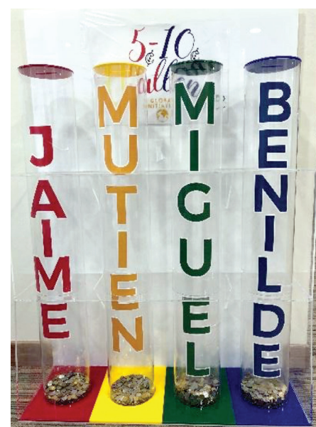
5-10 Cent Challenge

Our dedicated teachers use a child-centred, active learning approach, and strive to support the maximal development of each student. Teachers communicate with students on an individual level while celebrating each student's unique learning style, encouraging them to think and to act rather than to simply respond to the situations they encounter. The learning environment requires intellectual creativity and active class participation, providing students with opportunities for self-discovery, inspiration, exploration, and experimentation.