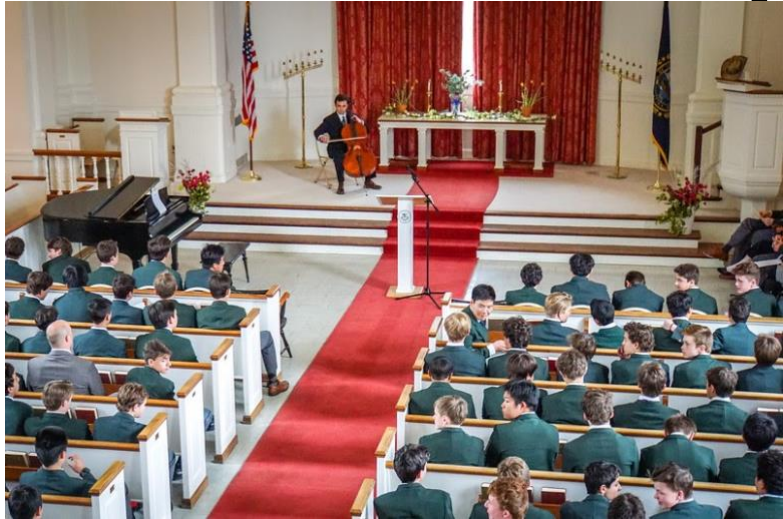
2019 Investiture ceremony