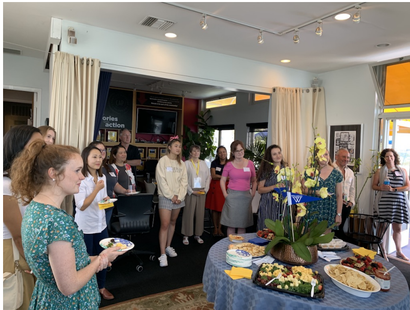
WLAN & WAAD 16th Annual High Tea on June 15, 2019