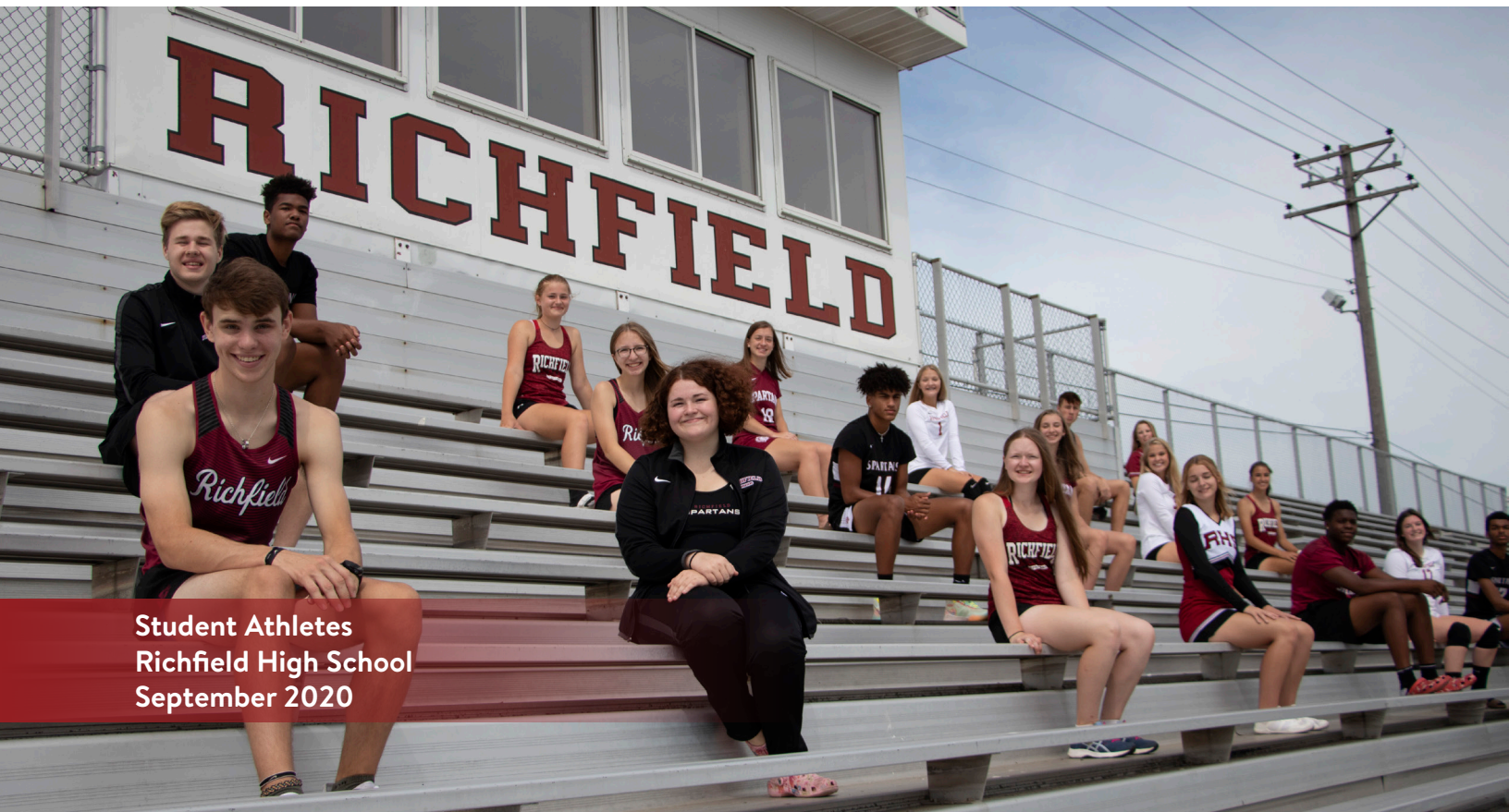
Student Athletes Richfield High School September 2020