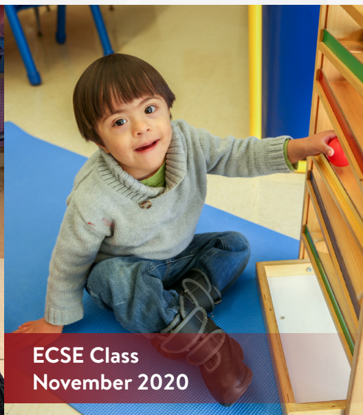
ECSE Class November 2020