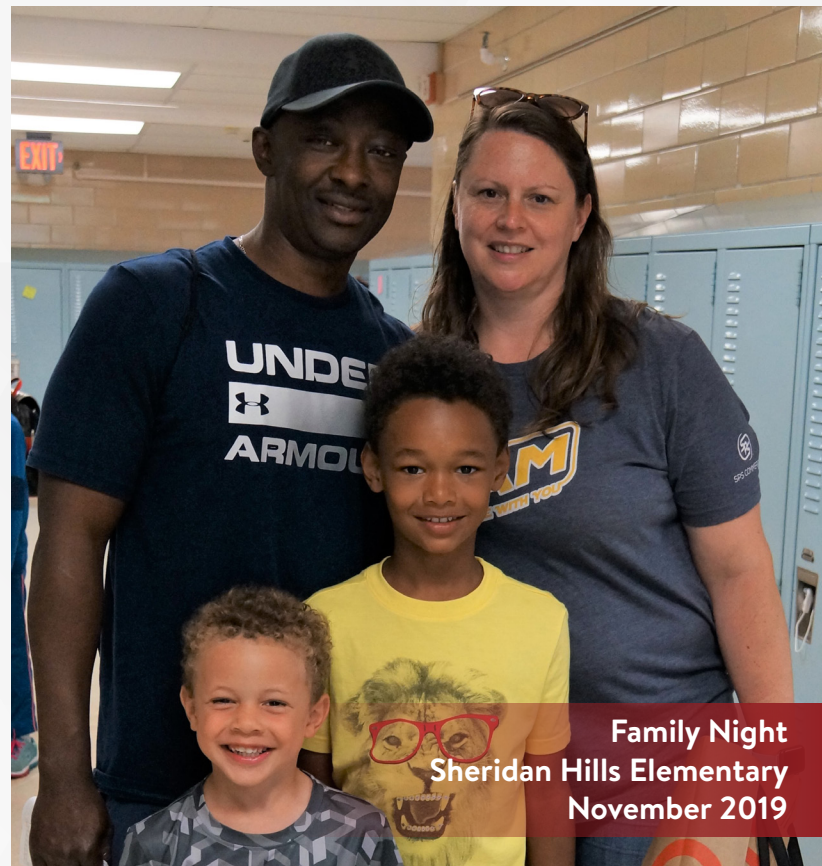
Family Night Sheridan Hills Elementary November 2019