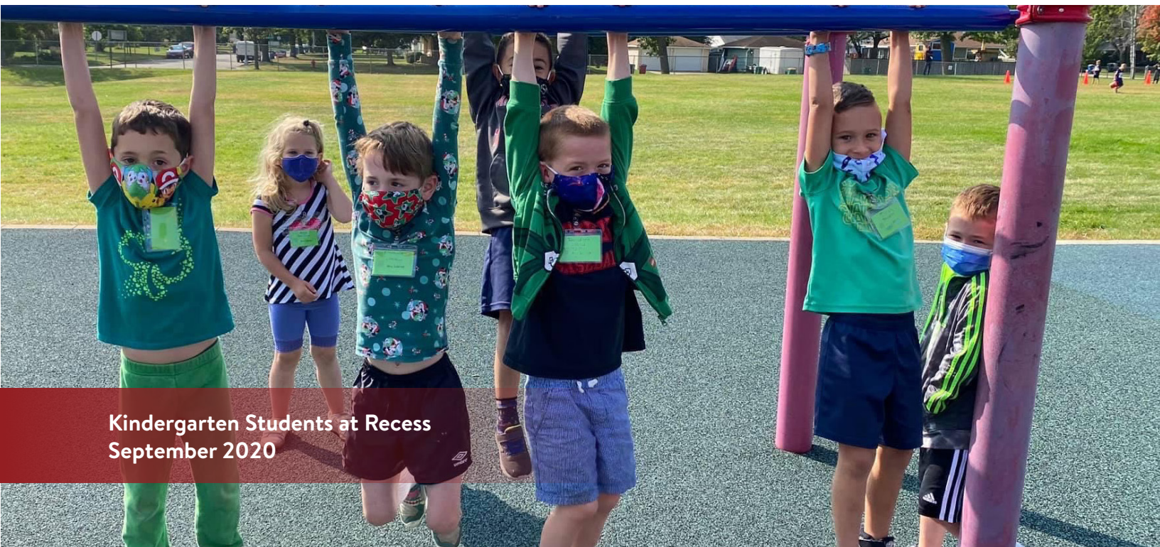
Kindergarten Students at Recess September 2020

Richfield Public Schools inspires and empowers each individual to learn, grow and excel.