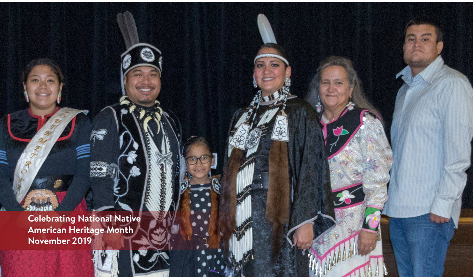
Celebrating National Native American Heritage Month November 2019