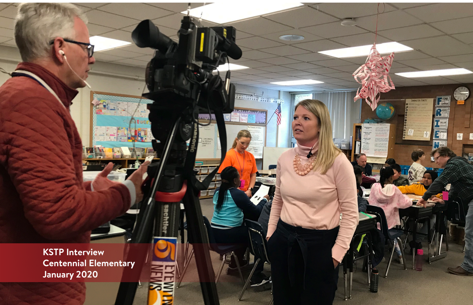
KSTP Interview Centennial Elementary January 2020