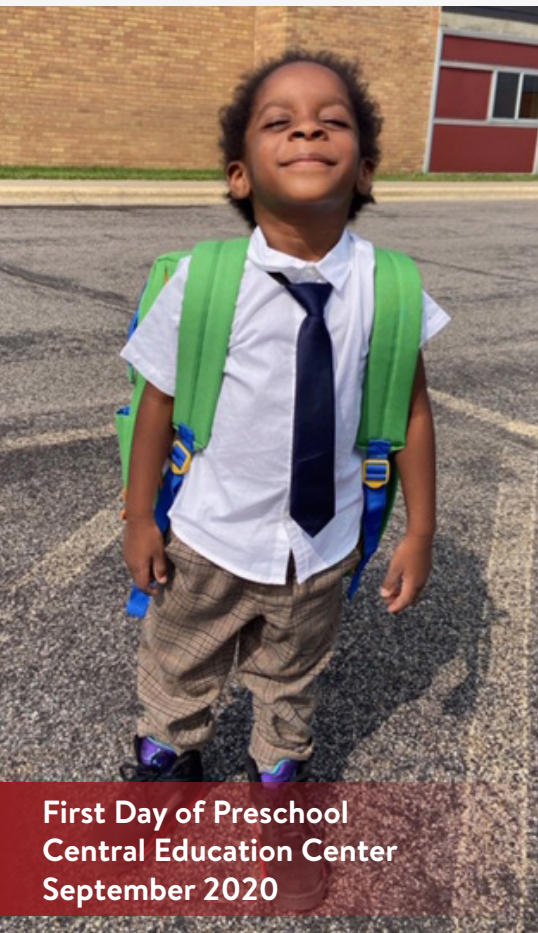
First Day of Preschool Central Education Center September 2020