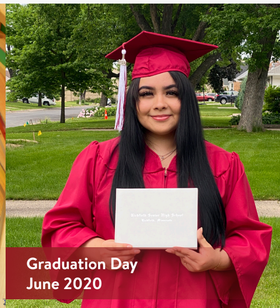
Graduation Day June 2020