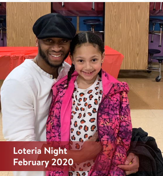
Loteria Night February 2020