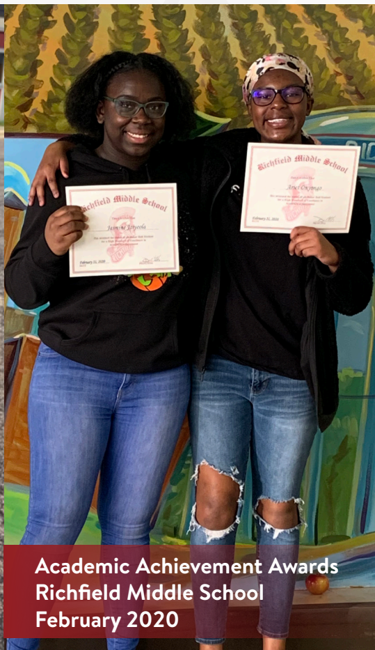
Academic Achievement Awards Richfield Middle School February 2020