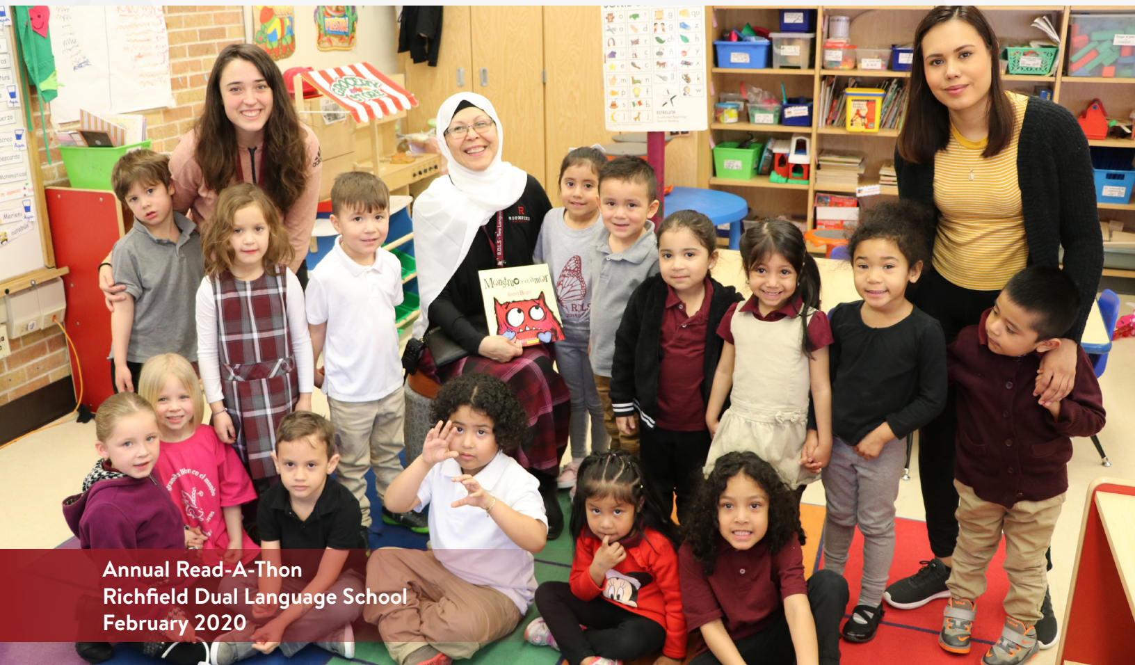
Annual Read-A-Thon Richfield Dual Language School February 2020