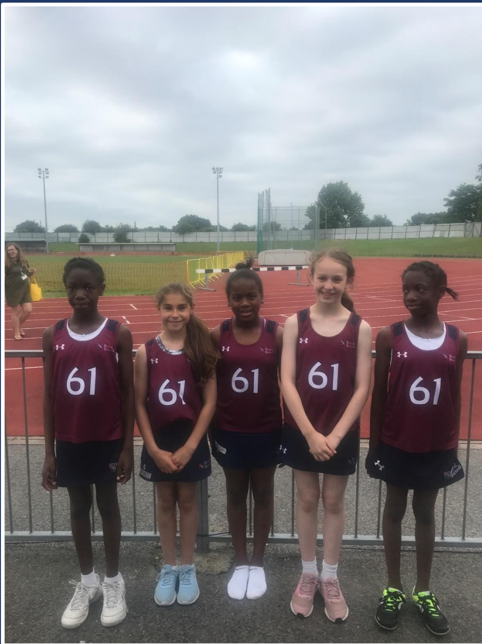
Girls Relay Team – Final - 4 th Place