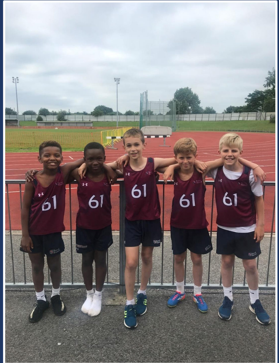
Boys Relay Team – Final – 3 rd Place