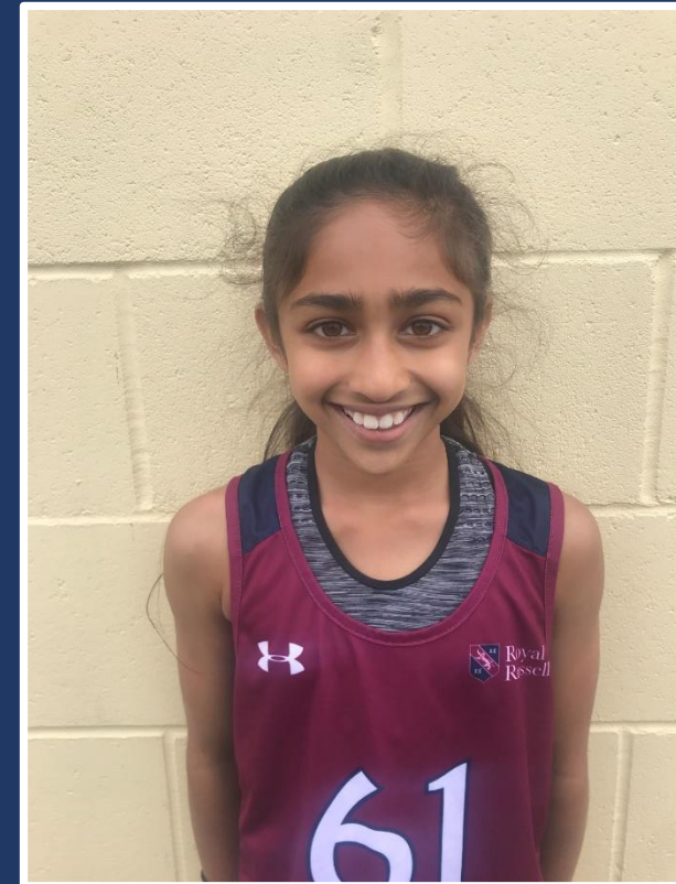
Oneli – High Jump Final 3 rd Place