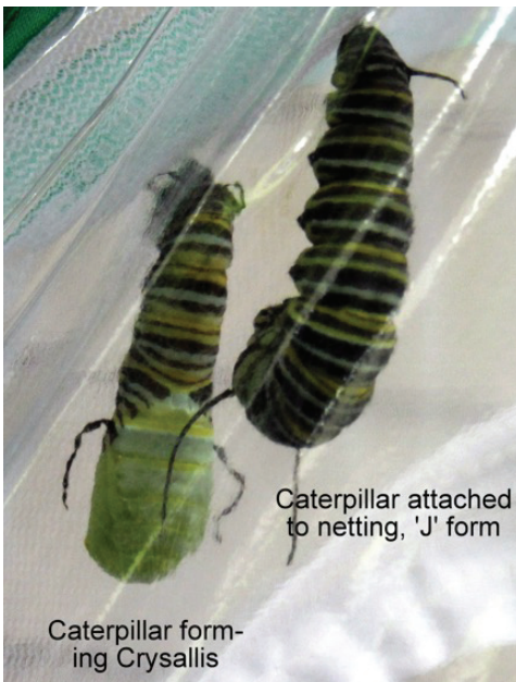
Caterpillar attached to netting, 'J' form