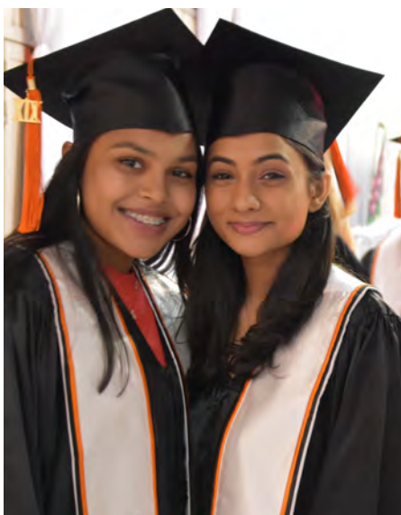
American International School Dhaka High School Profile 2019-20

AISD reports academic, conduct, and integrity issues/concerns of a serious nature.