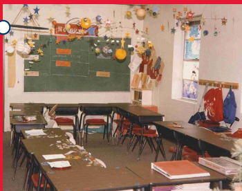
A middle school classroom in 1984, before the new middle school building was built