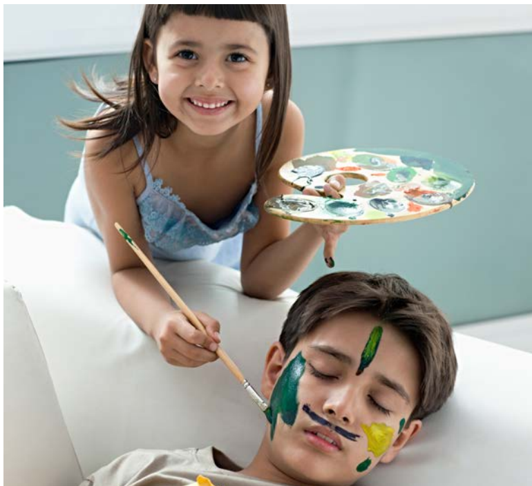
The best April Fools' pranks are fun but harmless!