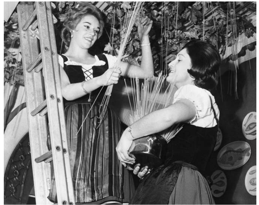
BBC TV's show Panorama showed a family from Switzerland during its annual "spaghetti harvest."

The Iranian (Persian) calendar is very old and is only used in Iran and Afghanistan. The thirteenth day of the Iranian new year is called Sizdah Bedar (seez-DAH be-DAR). It falls around April 1 and has been practiced since 536 BC. On Sizdah Bedar , families and friends share picnics, pranks, and fun. It might just be the oldest-known joke day in history.