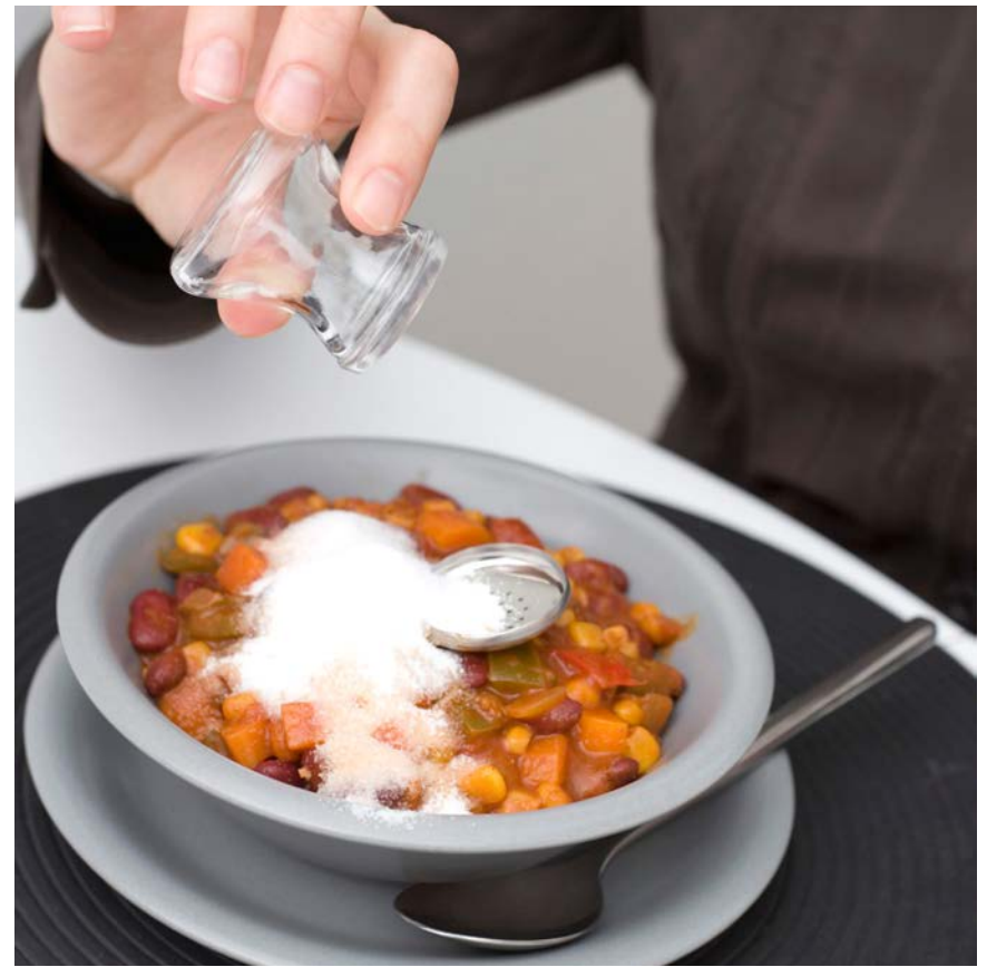
A common April Fools' joke is to loosen the top on a saltshaker.