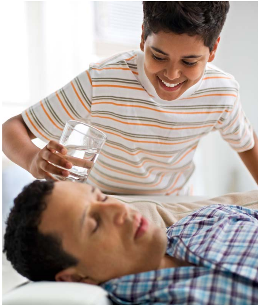
On April 1, you may need to plan for a rude awakening.

Popular pranks might be to put grease on a doorknob or swap the sugar for salt. You might get friends to do something silly, like try to buy plaid paint. When they realize it's a joke, it's traditional to shout "April Fools'!"