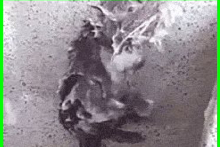
Using Soap & Water = Goodbye, Germs!