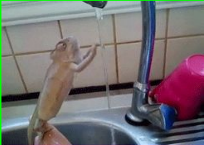
Just Water = Hello, Germs!

https://www.youtube.com/watch?v=-LKVUarhtvE