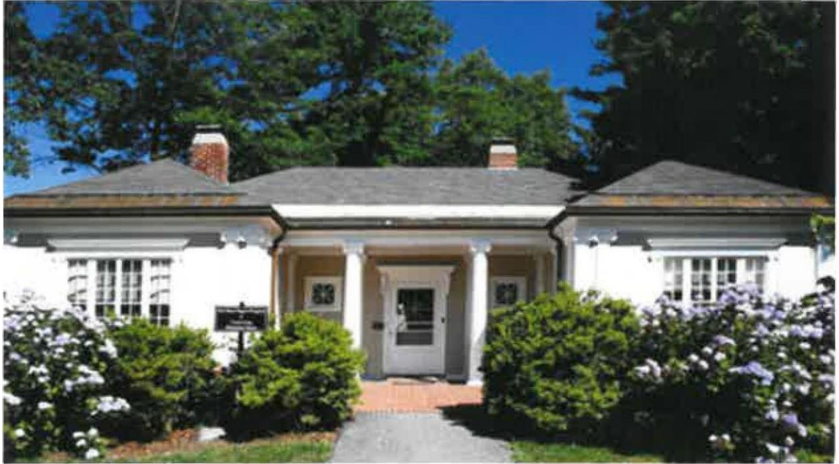
The Continuing Education House at Wellesley College