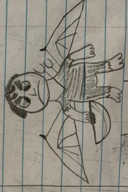
Stupid Turn page ->