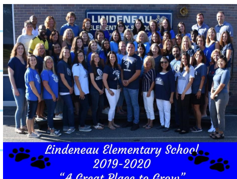
Lindeneau Elementary School 2019-2020 "A Great Place to Grow"