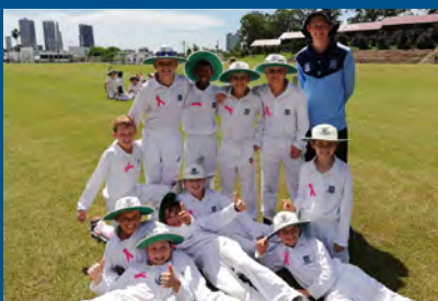
Pink Stumps Day