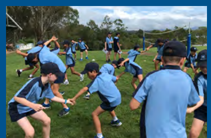
Year 5s at Moogerah