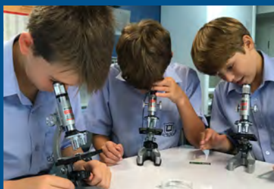
Fusing Science and Art