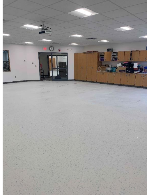
SFMS area A classroom substantially complete