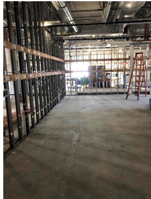
SFMS Metal Stud Walls Upper A