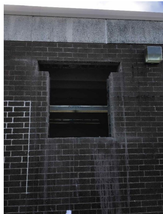
SFHS Metals Lab window cutout