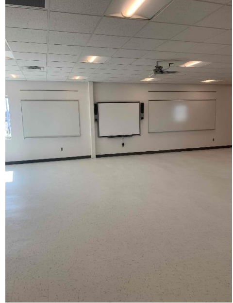
SFMS door frame install upper A