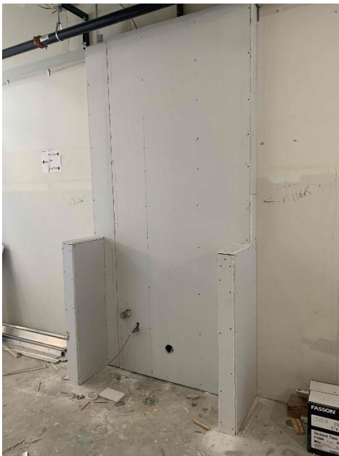
SFMS Upper A water fountain rough in