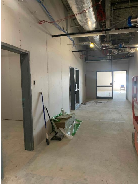
SFMS Upper A drywall install