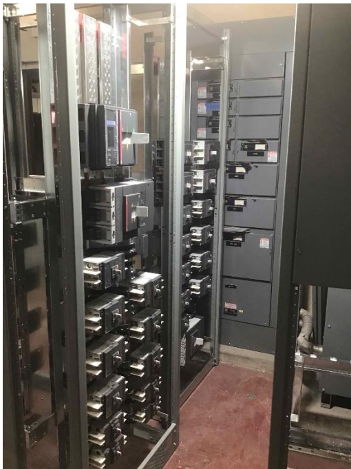
SFHS Electrical Work