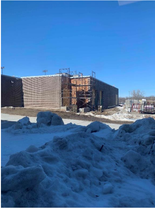
SFHS brick install at fitness area