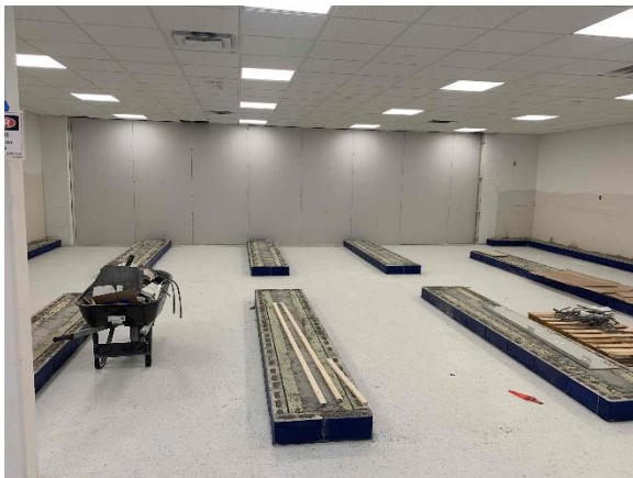
SFMS Locker Bases Install