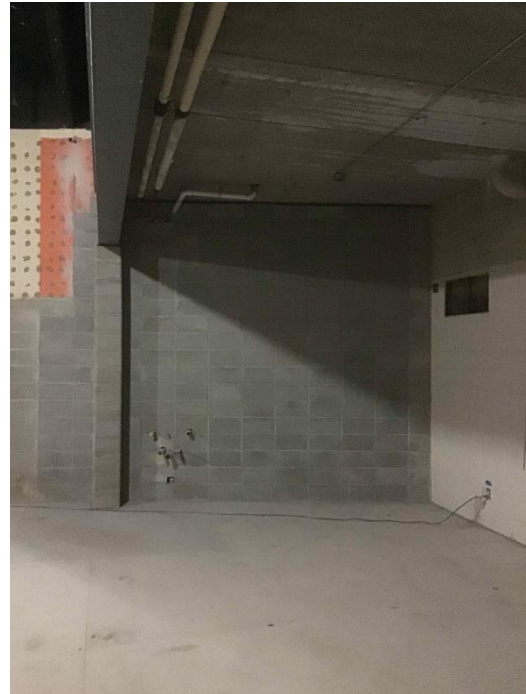
SFHS Area F masonry wall