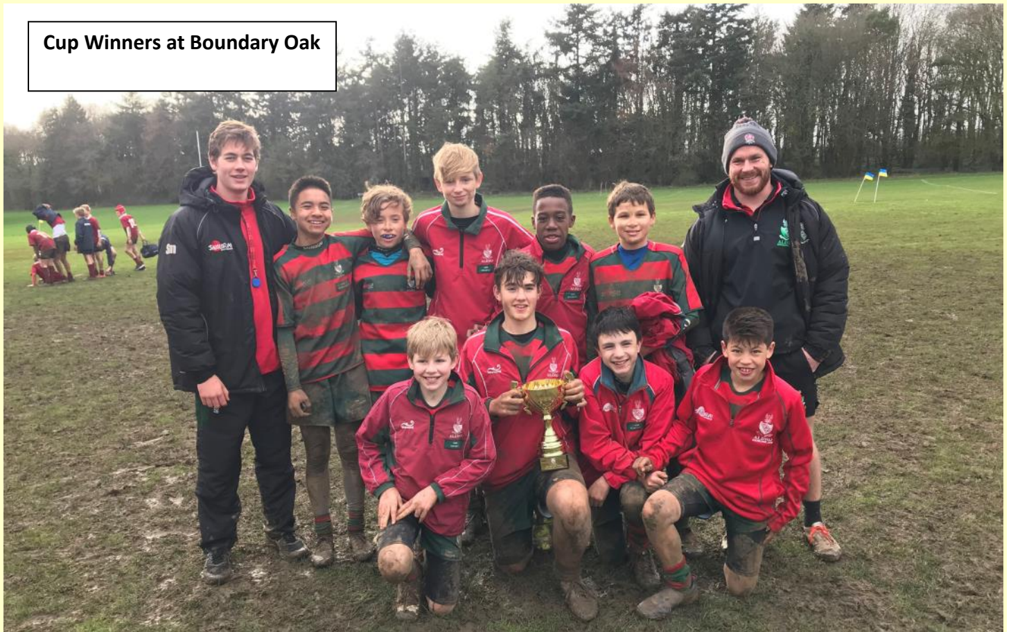
Cup Winners at Boundary Oak