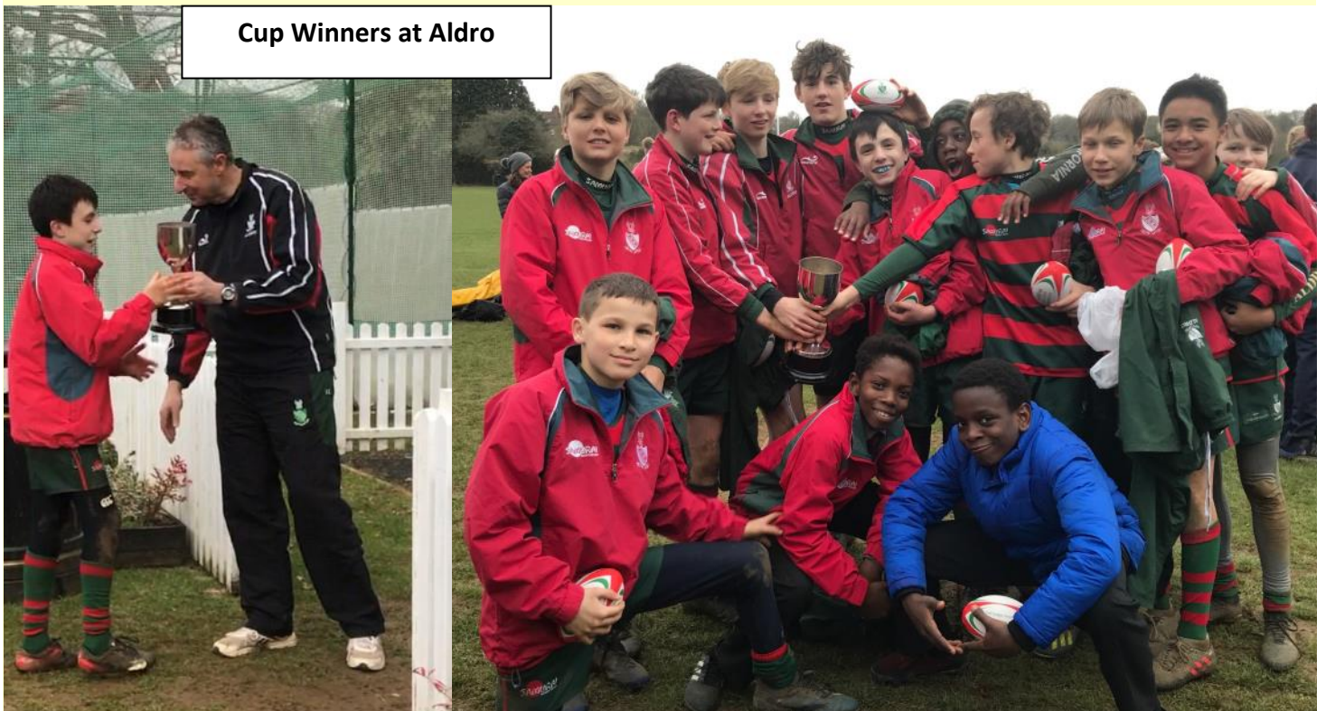
Cup Winners at Aldro

Moving into the cup group, we found ourselves against familiar opposition in Shrewsbury House, Westbourne House and Feltonfleet. The first game was Shrewsbury House, and I can only say that the boys played out of their skin to totally dominate Shrewsbury House in every facet of the game. Very, very pleasing to see. We then had two tough games against Westbourne House and Feltonfleet, but after the performance against Shrewsbury House, it was evident to see in the boys' eyes that there was no chance they would let the tournament slip at this stage. Winning both games, Aldo take home the trophy! Now on to the finale at Rosslyn Park.