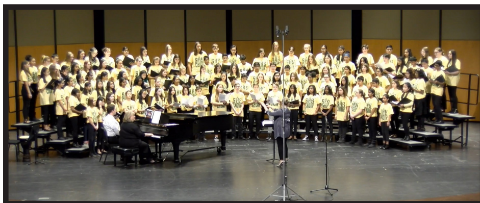
Consortium 125 Choirs