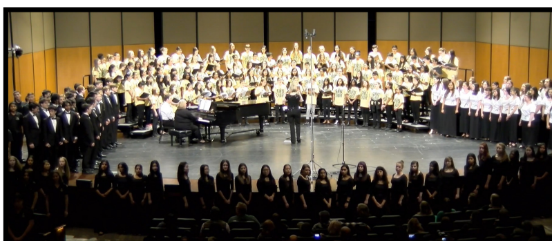
All Groups Together