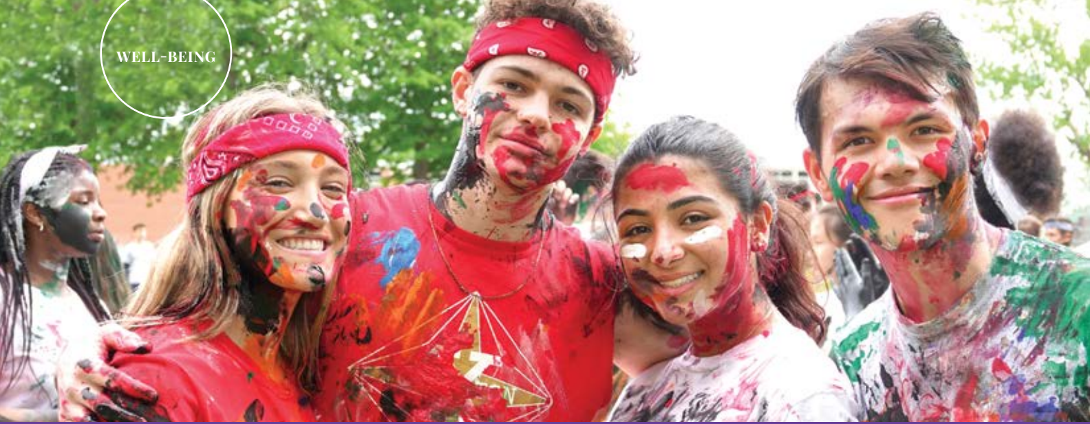
(Above) Students dress in house colours for our annual Shourawe (friendly house wars)