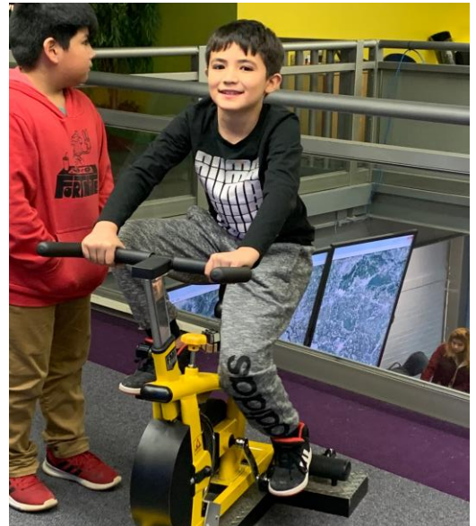
Students in the MyTime Program at Greatman Elementary enjoyed all of the interactive activities during their recent visit to the Aurora Sci Tech Museum.