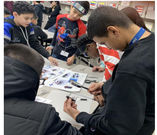
Students learn about the anatomy of grasshopper during the Tech Learning Lab at HergstMyTime Program

Unstructured, unscheduled time allows children opportunities to imagine and create.