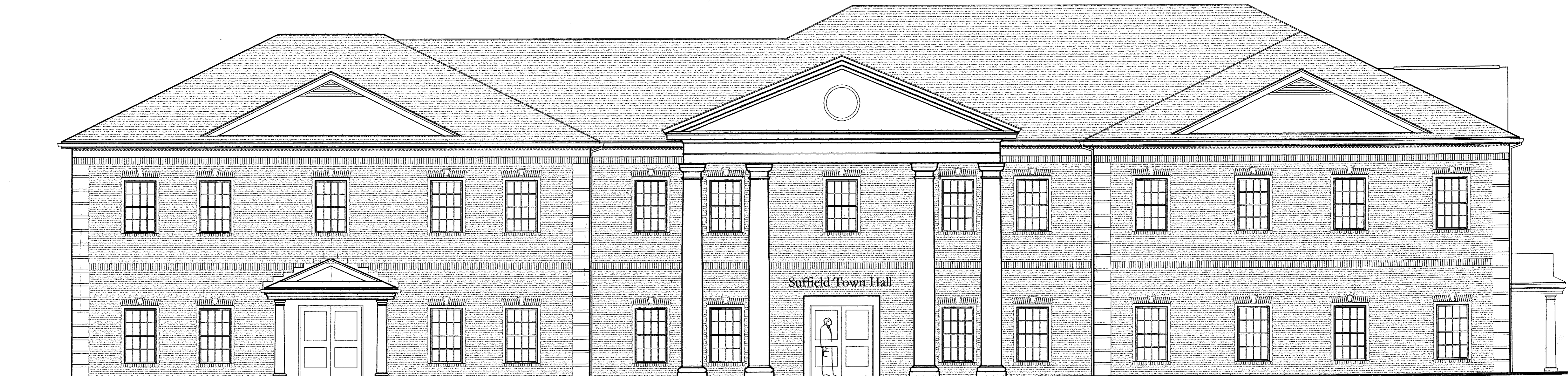
Proposed Covered Entry West Elevation Scale: 3/16" = 1'-0"