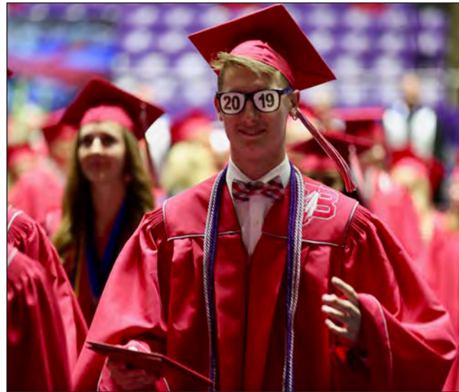
A Bountiful High student celebrates graduation in 2019.

Davis School District now touts the second-highest