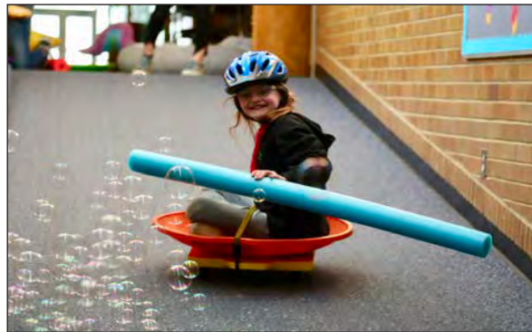
Top: It was below 40 degrees when the C.A.R.E.S. program celebrated with an indoor beach party. Left: Students were creative with their mode of transportation on the indoor slip and slide.