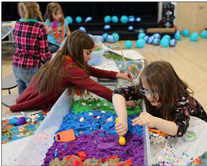
Far left: You can never have too many umbrellas in a tropical drink. Left: Students build sand castles during the indoor beach party.