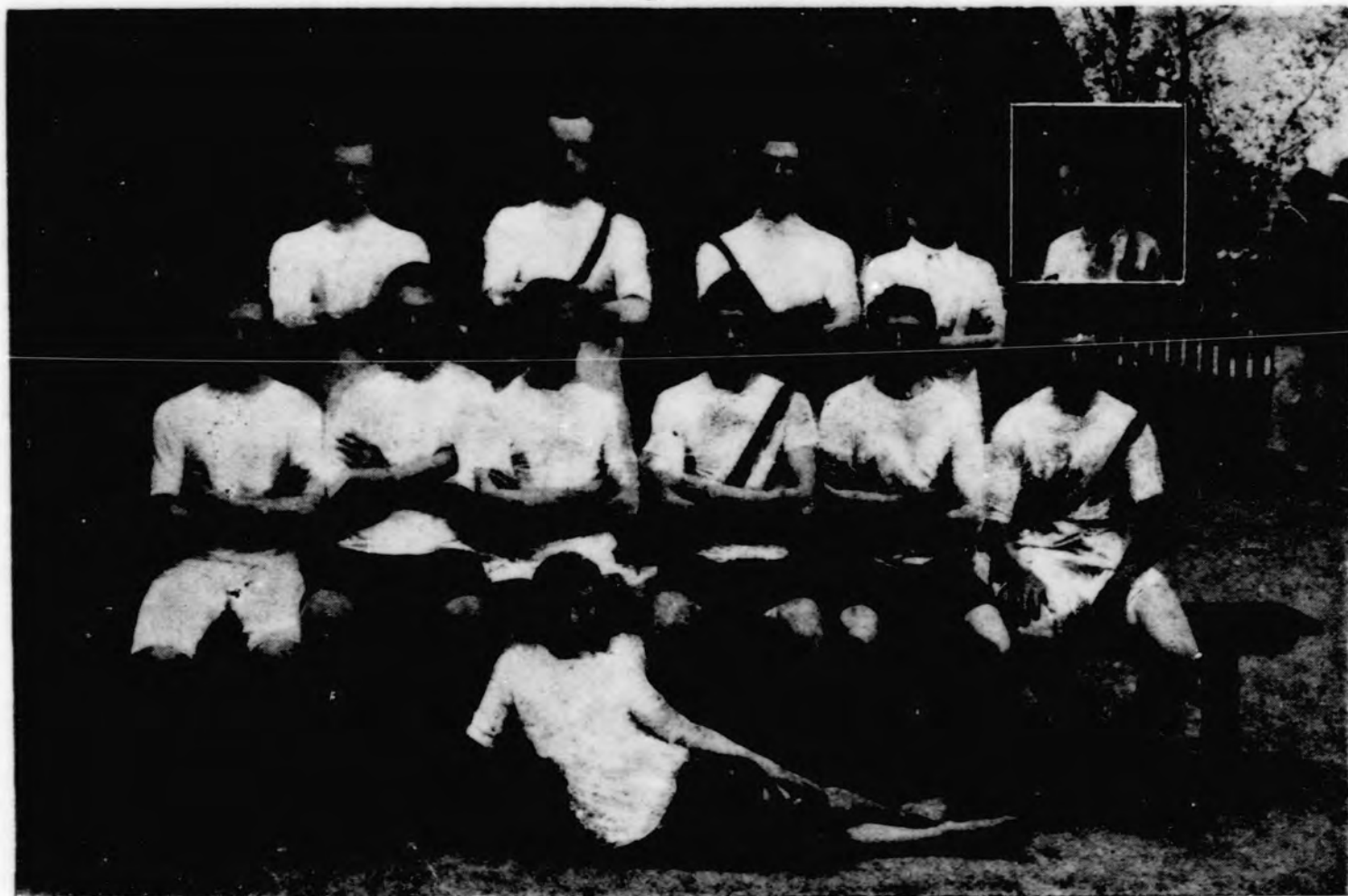
ATHLETIC REPRESENTATIVES IN THE INTER-SCHOOL COMPETITION, 1913