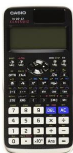
FX - 991EX

Please note that items of stationary are available from the Senior School Office