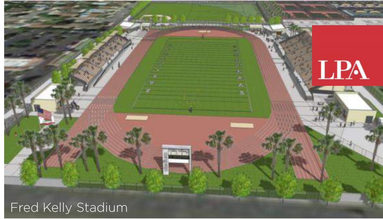
Fred Kelly Stadium