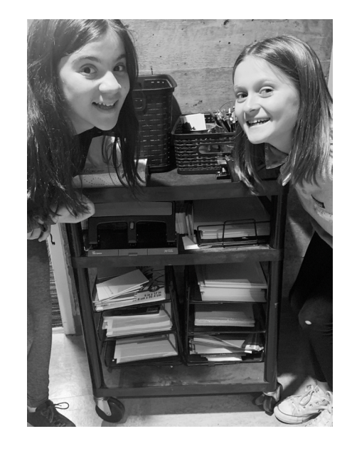
Where is this?