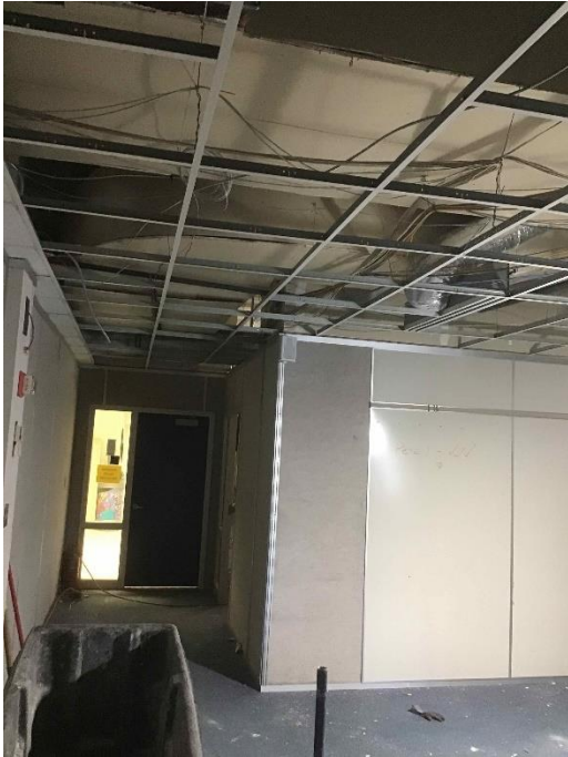
SFHS upper area K demo