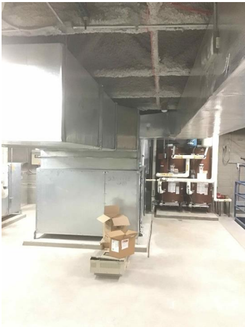
SFHS Area B mezzanine work