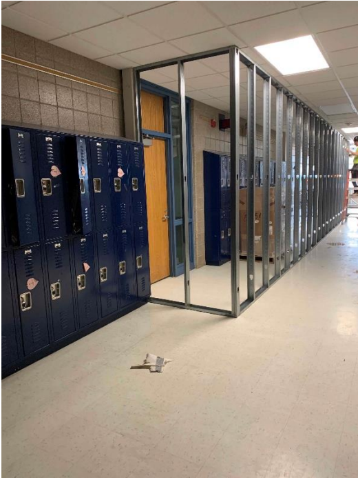
SFMS Temp wall in area A