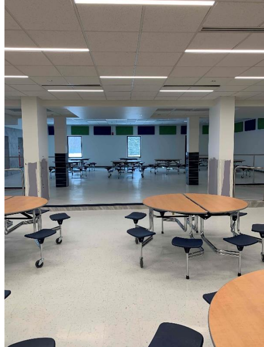
SFMS Cafeteria addition