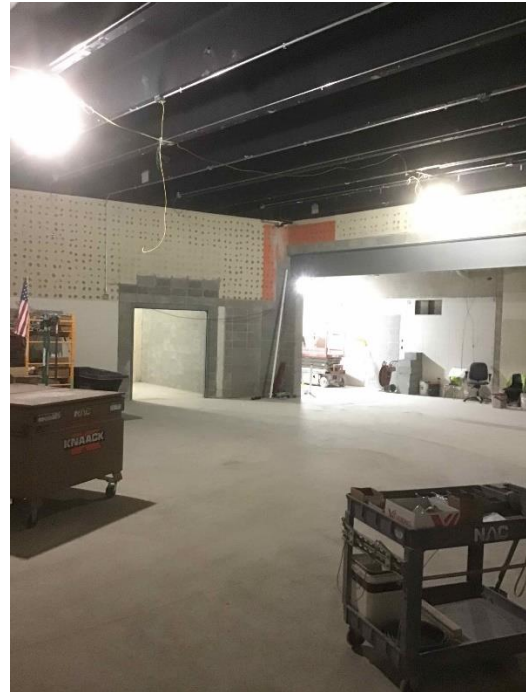
SFHS Area F block wall and I beam