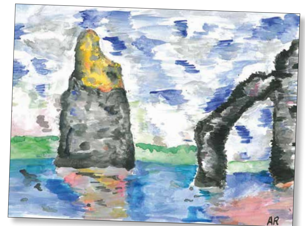
Amelia Robinson-Stanier Year 6 Watercolour landscape in the style of Claude Monet's coastal scenes.