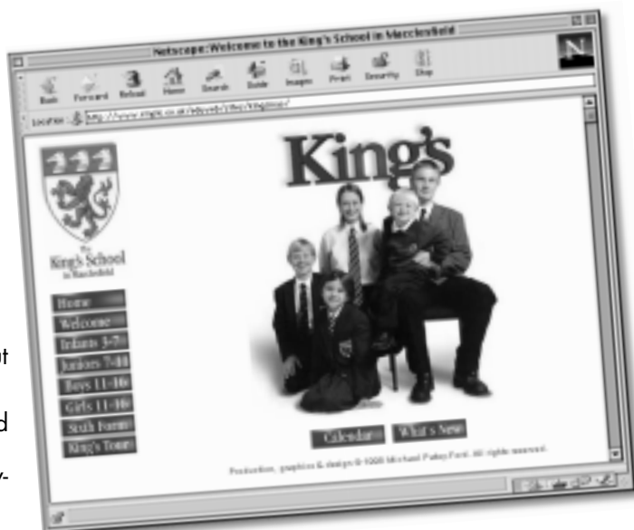
The King's Home Page can be found at the address below. Please visit and let us know what you think

In line with this, the school is upgrading its Internet access by investing in a new network of computers, linking the two sites across town, which will allow pupils to 'surf the net' at high speed. The network will be based in the Information Resource Centres on each site, providing