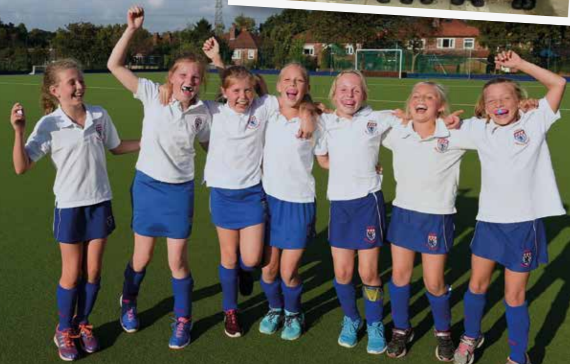
Year 6 girls enjoying the new sports facilities