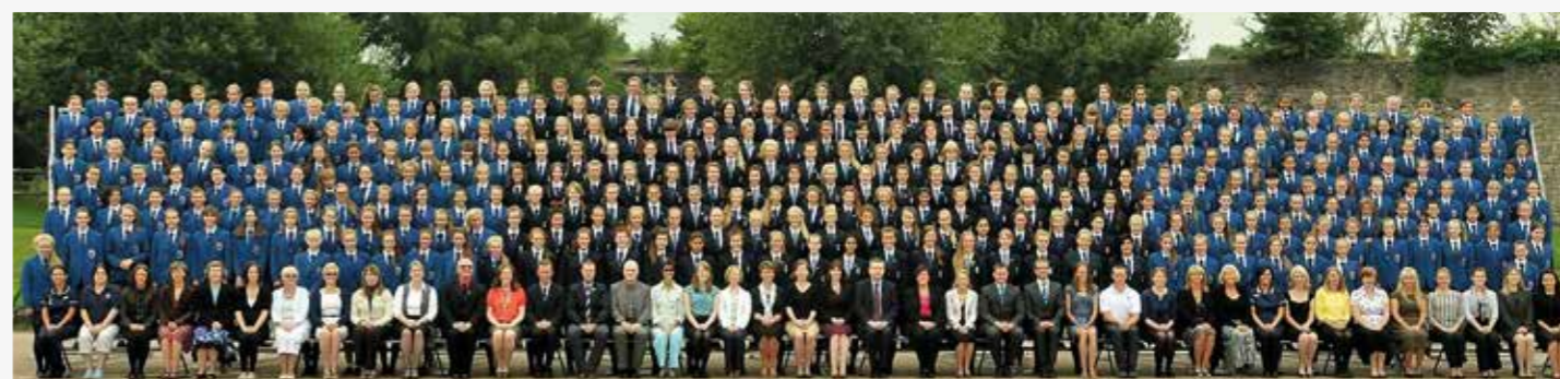
This term marks the 20th anniversary of the opening of King's Girls' Division. We are marking the occasion with a series of activities throughout the year, including