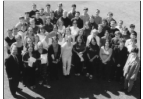
Just some of the GCSE pupils who obtained a minimum of 8 grade As.

The Boys' GCSE results make equally good reading, and are the best in the history of the school: