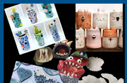
Art Extension Clubs