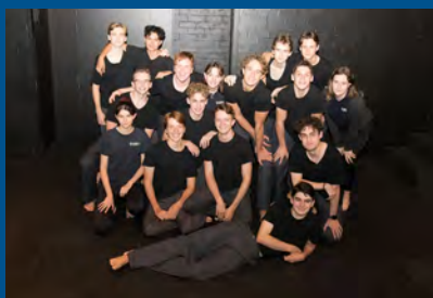
Drama Cast Announced