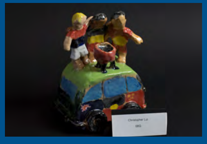
Cultural Identity Art