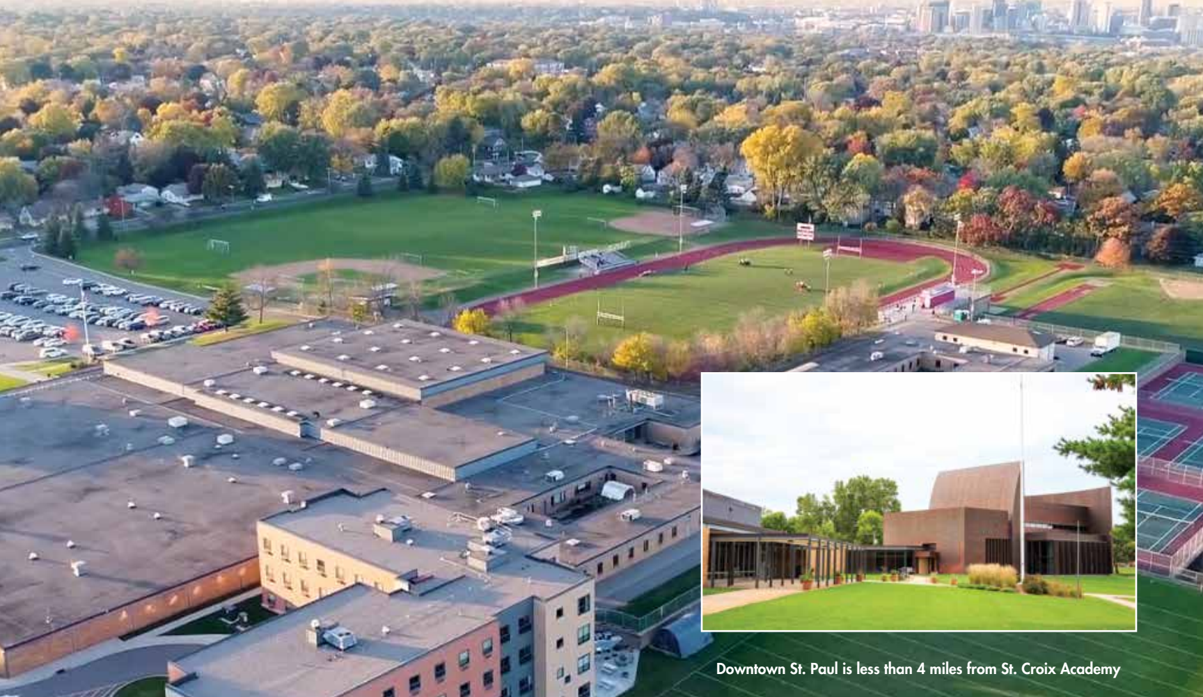
Downtown St. Paul is less than 4 miles from St. Croix Academy