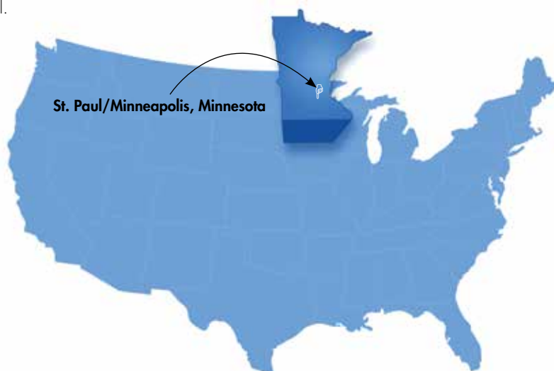
St. Paul/Minneapolis, Minnesota

The Minneapolis/St. Paul International Airport (MSP) has daily international flights.