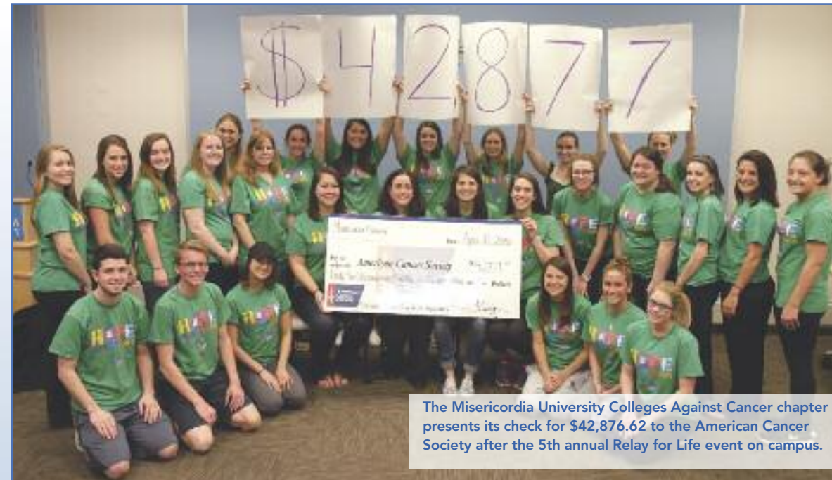
The Misericordia University Colleges Against Cancer chapter presents its check for $42,876.62 to the American Cancer Society after the 5th annual Relay for Life event on campus.

Relay for Life was held in the Anderson Sports and Health Center. It