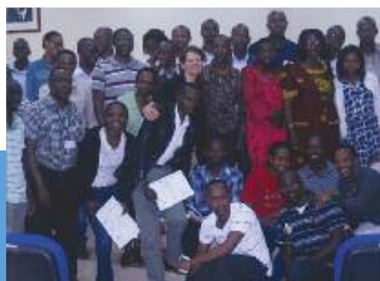
Rwandan physiotherapists from the first cohort pose for a picture after completing one of their classes at the University of Rwanda College of Medicine and Health Sciences in Kigali.