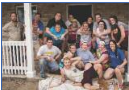
Eighteen students participated in a Habitat for Humanity service in Dickinson, Texas.

Fifty students and eight chaperones participated in the annual spring break service trips that were coordinated by Campus Ministry in March.