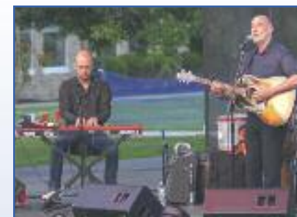
Marc Cohn performs at the Under the Stars Summer Arts Festival's Starlight Concert.