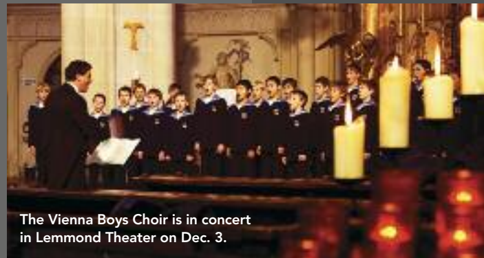
The Vienna Boys Choir is in concert in Lemmond Theater on Dec. 3.