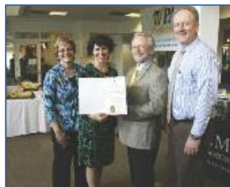
Misericordia and Metz representatives accept a PA Preferred certificate from the PA Department of Agriculture.

The Bureau of Market Development for the Pennsylvania Department of Agriculture presented a PA Preferred certificate of appreciation at a program designed to showcase the products.