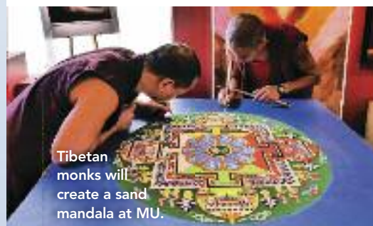
Tibetan monks will create a sand mandala at MU.

For more information about the program, please go to www.misericordia.edu/theartsandmore or call (570) 674-6719.