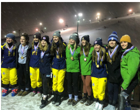
The Notre Dame Girls Varsity Ski team captured Divisional titles in both the Giant Slalom and Slalom