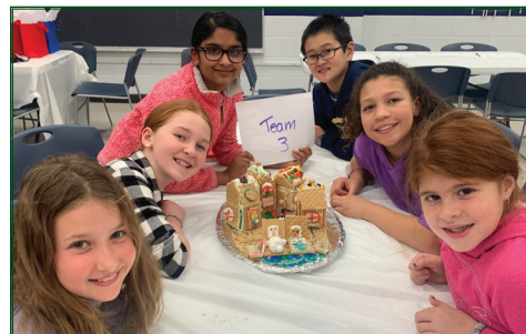
THE WINNING GINGERBREAD HOUSE! BRS students and students from the Amity HS Leo's Club (Jr. Lions) held the 1st annual Gingerbread House Competition. During this after school activity in January, Amity High School students worked with our students to create fanciful gingerbread houses while providing a leadership opportunity for Amity Leo's.

OUR ANNUAL SURVEY WILL BE MOVED UP to March this year. We hope to add questions about our school calendar and questions regarding our upcoming Strategic Plan Revision Process. More information will be coming to parents via the Swift K12 Notification system.