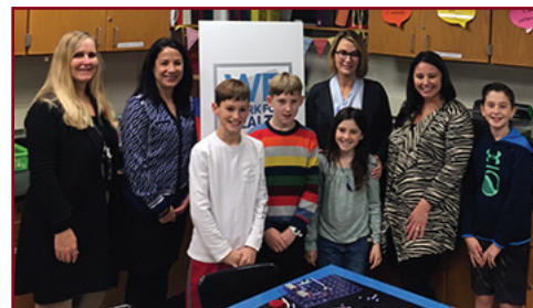
BRS IS AWARDED STEM Talent Pipeline Grant. State Rep. Themis Klarides (center-rear) joins BRS teachers, administrators and students in celebrating the state-coordinated grant.