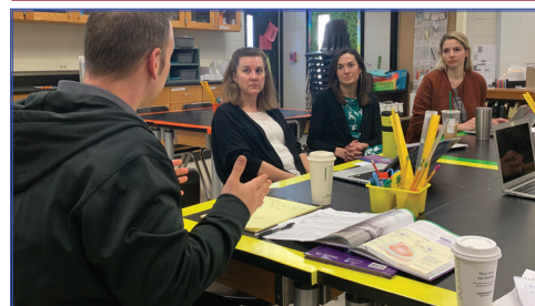
SCIENCE EDUCATION has New Generation Science Standards. Grade 6 teachers from BRS and Amity Middle School 7th grade science teachers worked together in developing understandings of the new standards and how BRS and the middle school will ensure continuity of instruction between the two levels.