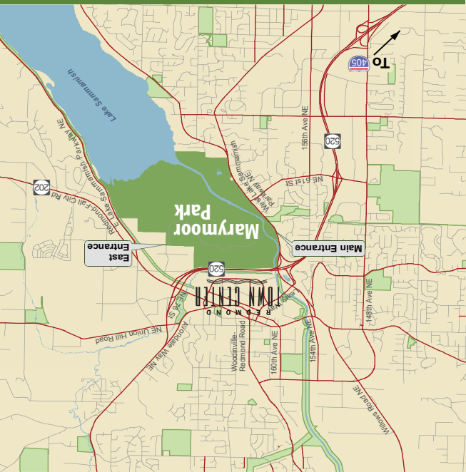
Marymoor Park Vicinity